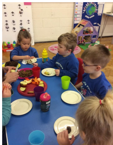
Haggis tasting for Burns Night