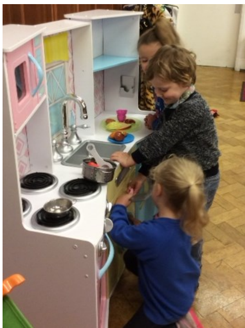
Enjoying the new play kitchen